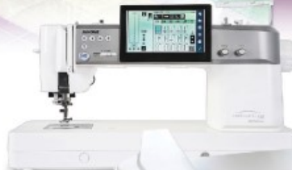
CONTINENTAL M8 PROFESSIONAL