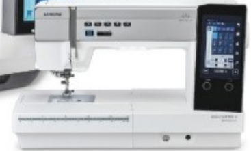
HORIZON MEMORY CRAFT 9480QCP PROFESSIONAL