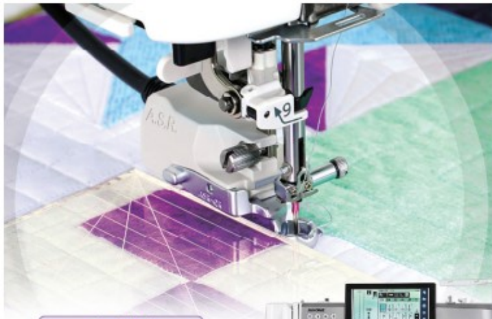
A.S.R.™ Accurate Stitch Regulator System