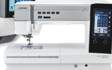
HORIZON MEMORY CRAFT 9480QC PROFESSIONAL