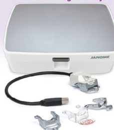
A.S.R.™ Accurate Stitch Regulator System