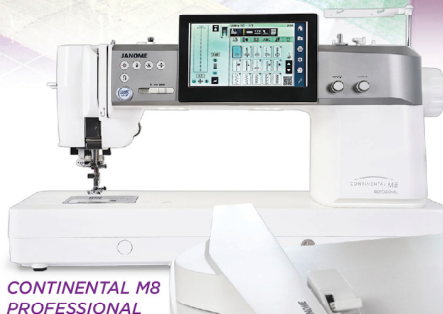
CONTINENTAL M8 PROFESSIONAL