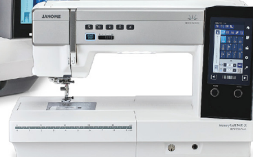
HORIZON MEMORY CRAFT 9480QC PROFESSIONAL