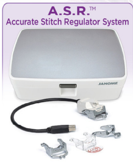
A.S.R.™ Accurate Stitch Regulator System