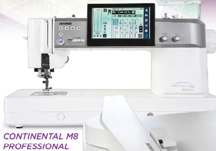
CONTINENTAL M8 PROFESSIONAL