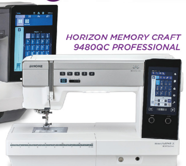
HORIZON MEMORY CRAFT 9480QC PROFESSIONAL