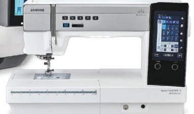
HORIZON MEMORY CRAFT 9480QC PROFESSIONAL